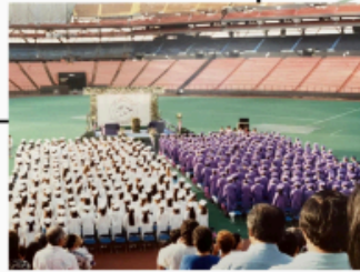
photo features Pearl City High School Class of 1991.